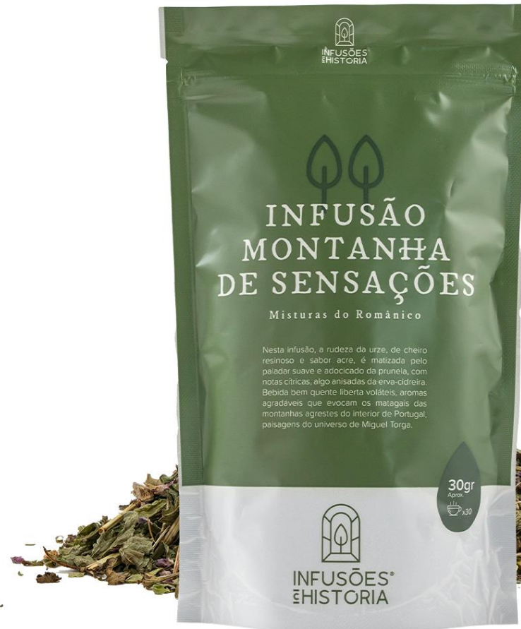
Doypack Bag (30g)