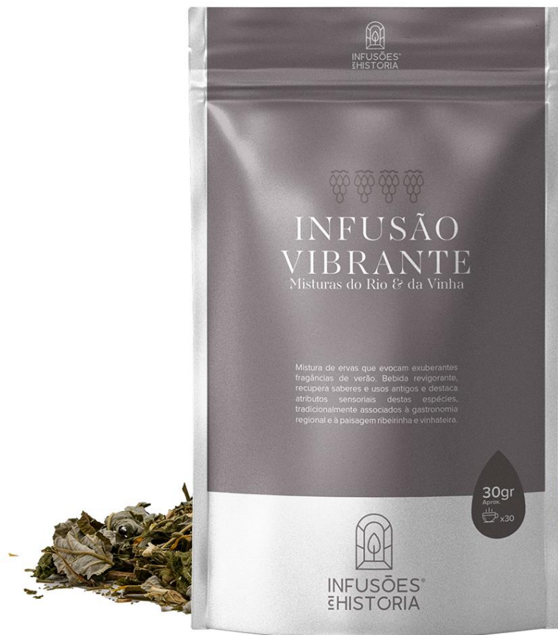
Doypack Bag (30g)