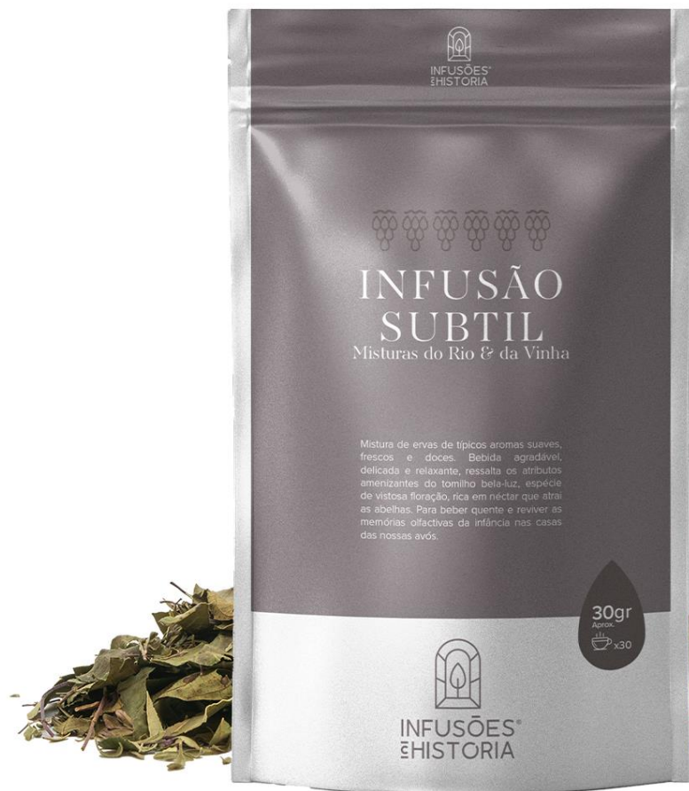
Doypack Bag (30g)