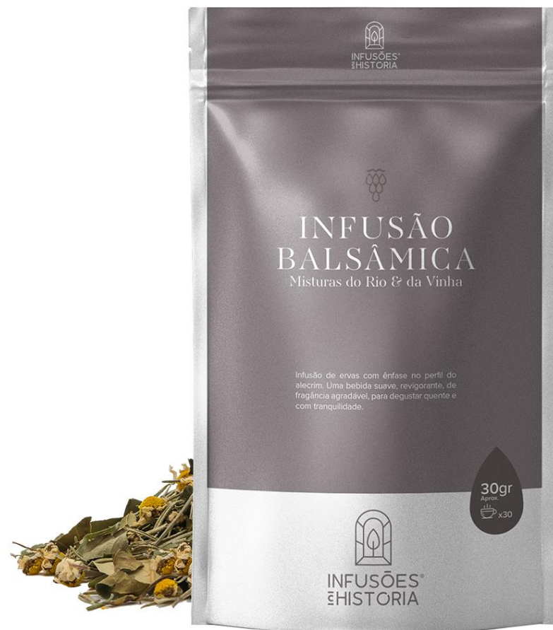
Doypack Bag (30g)

(rosemary, chamomile, bay and walnut tree)