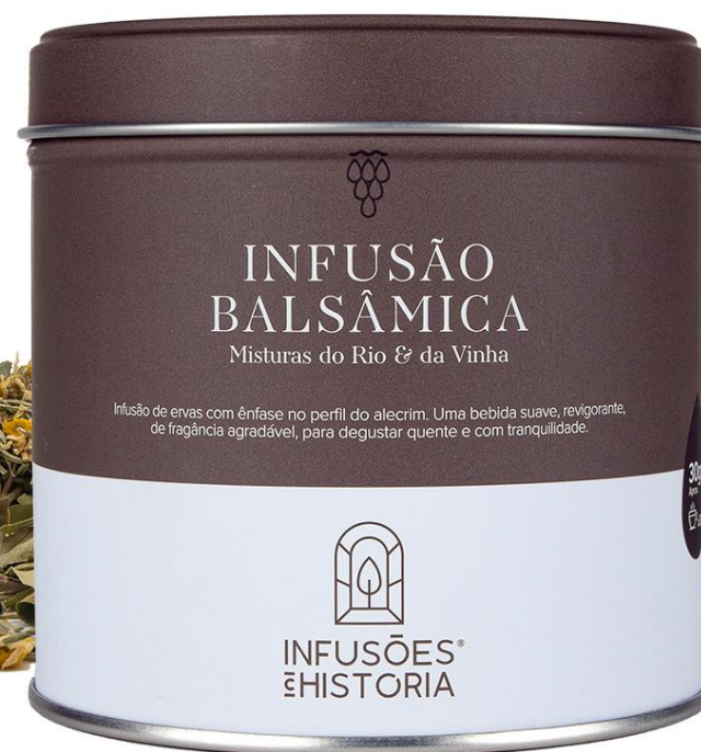
Big Can (30g)