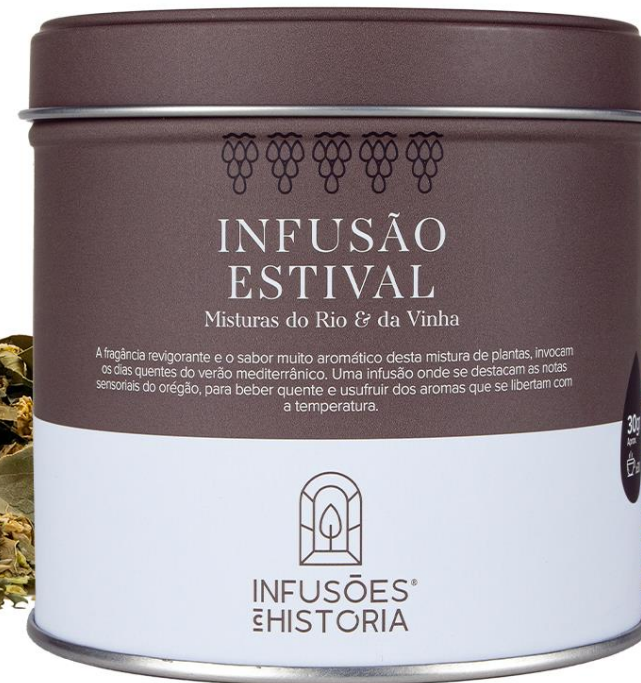
Big Can (30g)