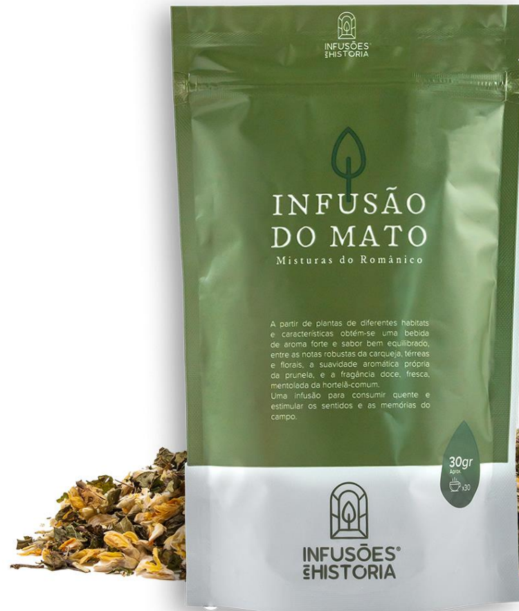
Doypack Bag (30g)

(carqueija, spearmint and common self-heal)