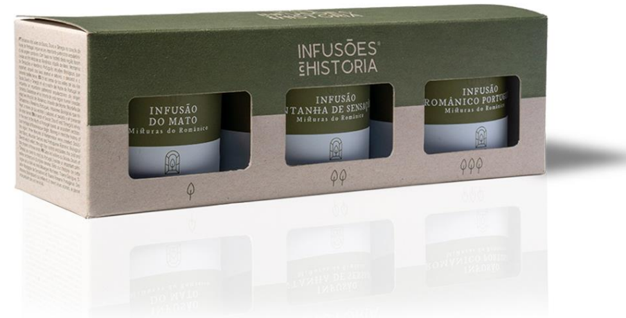
Box with three small cans (3x8g)