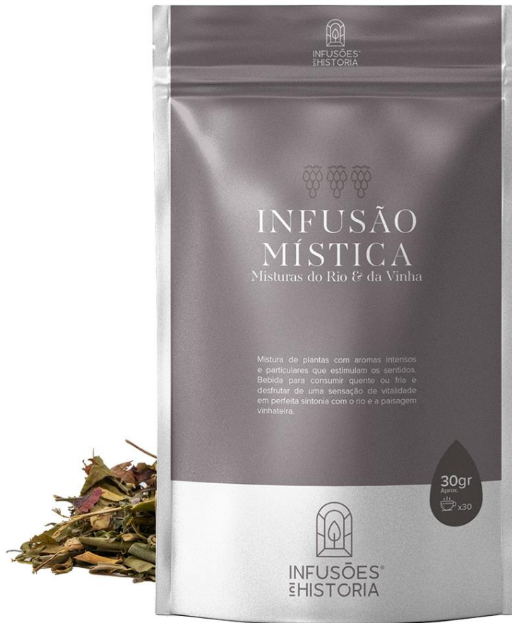
Doypack Bag (30g)