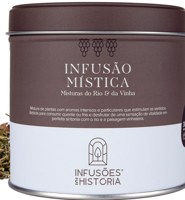
Big Can (30g)