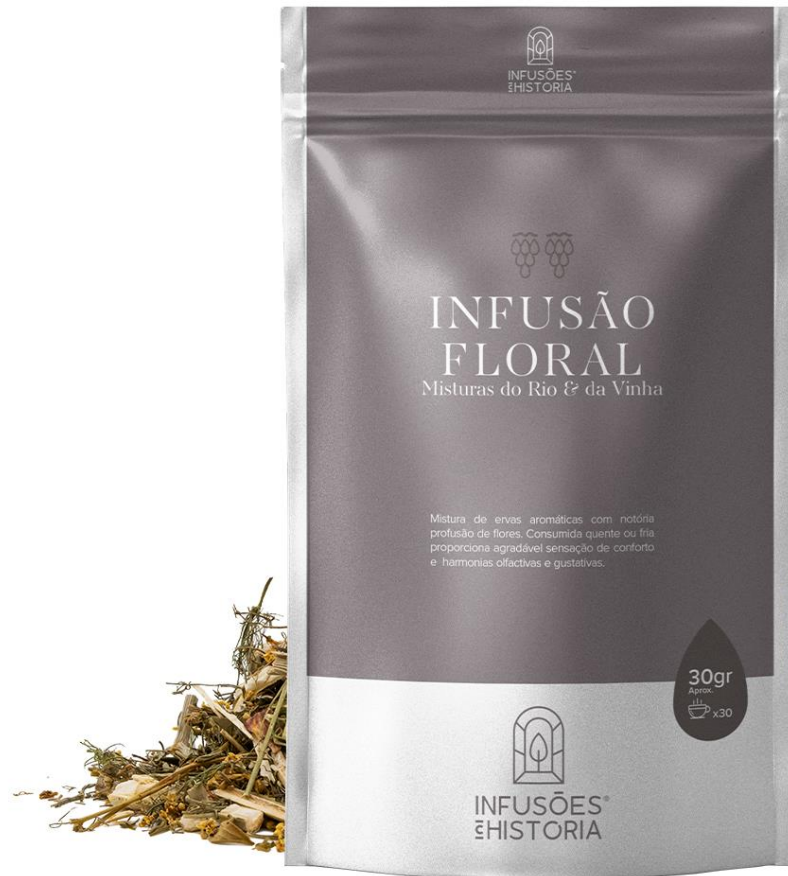
Doypack Bag (30g)