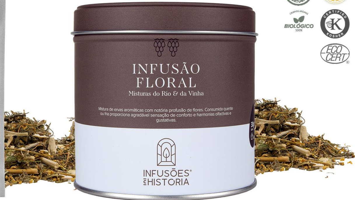
Big Can (30g)