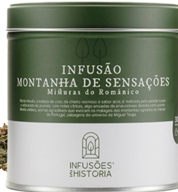
Big Can (30g)