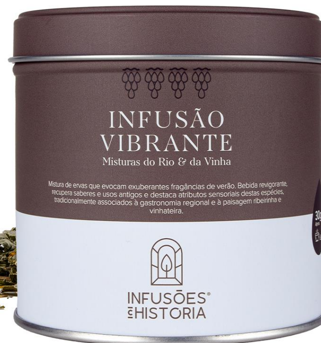
Big Can (30g)