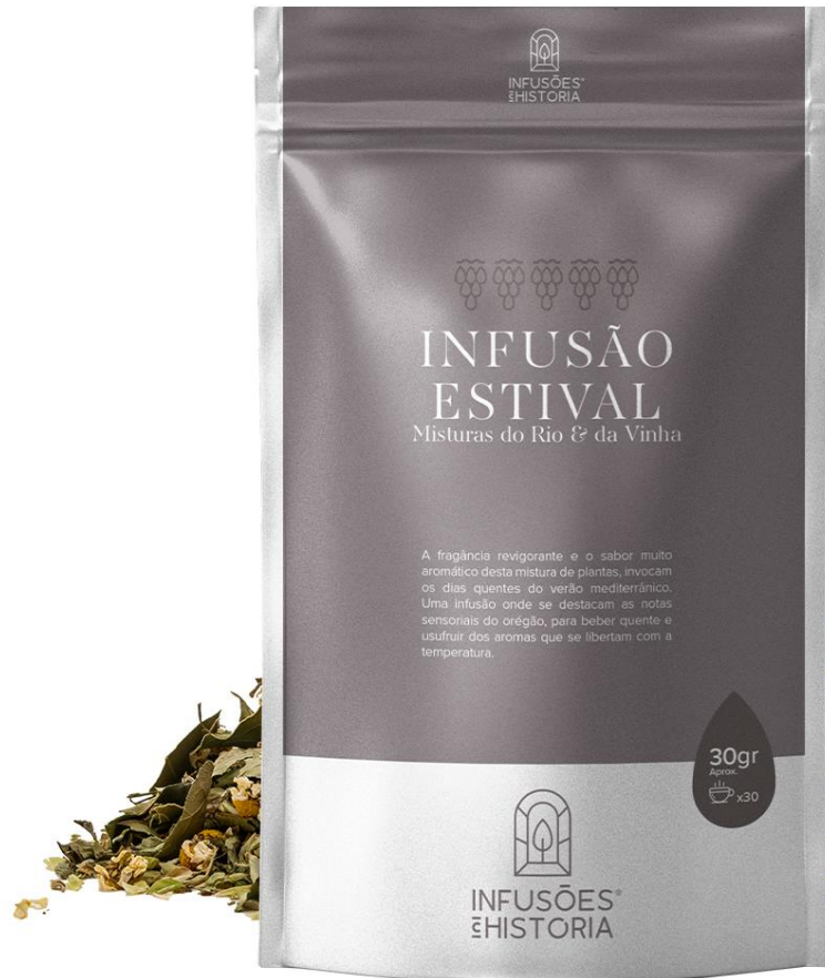
Doypack Bag (30g)

(oregano, chamomile, bay and walnut tree)