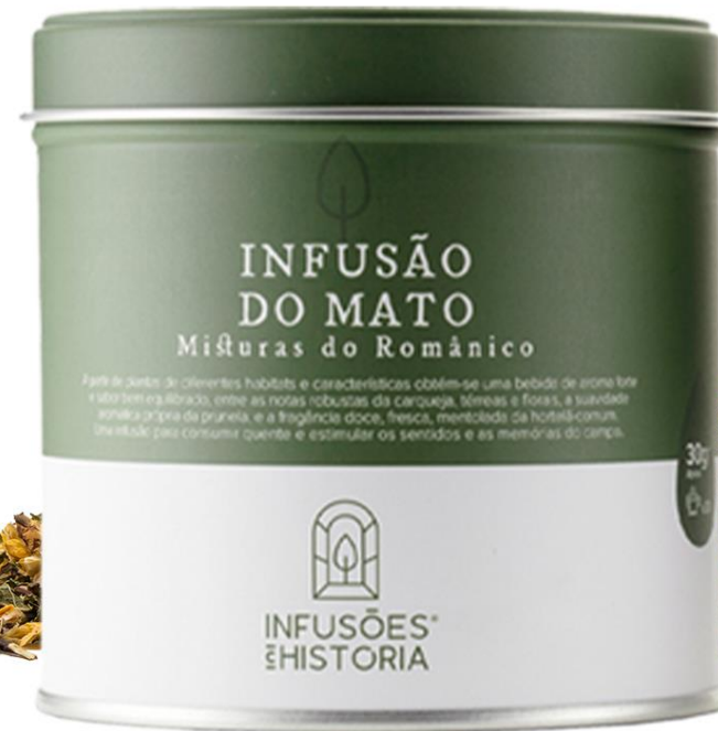
Big Can (30g)