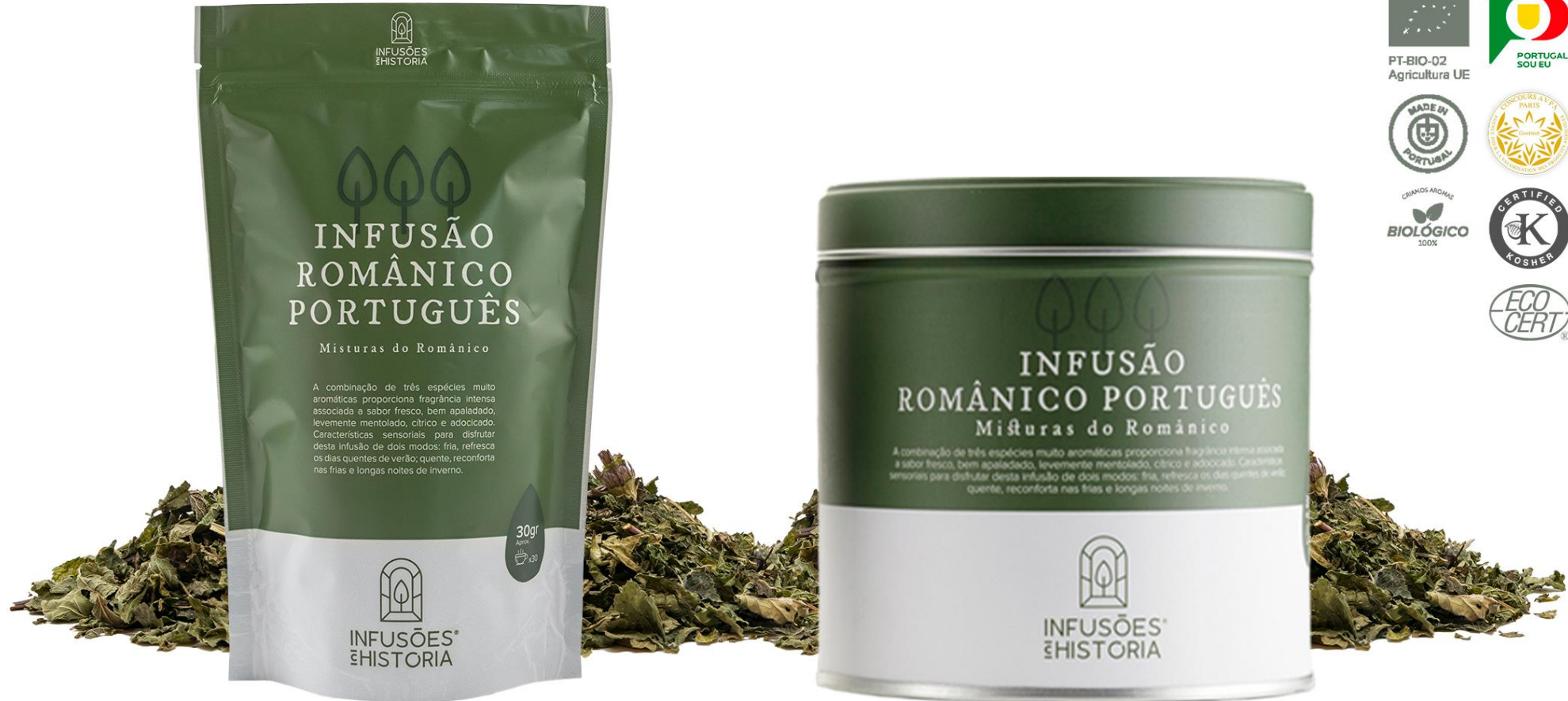
Doypack Bag (30g)

(lemon balm, spearmint and common self-heal)